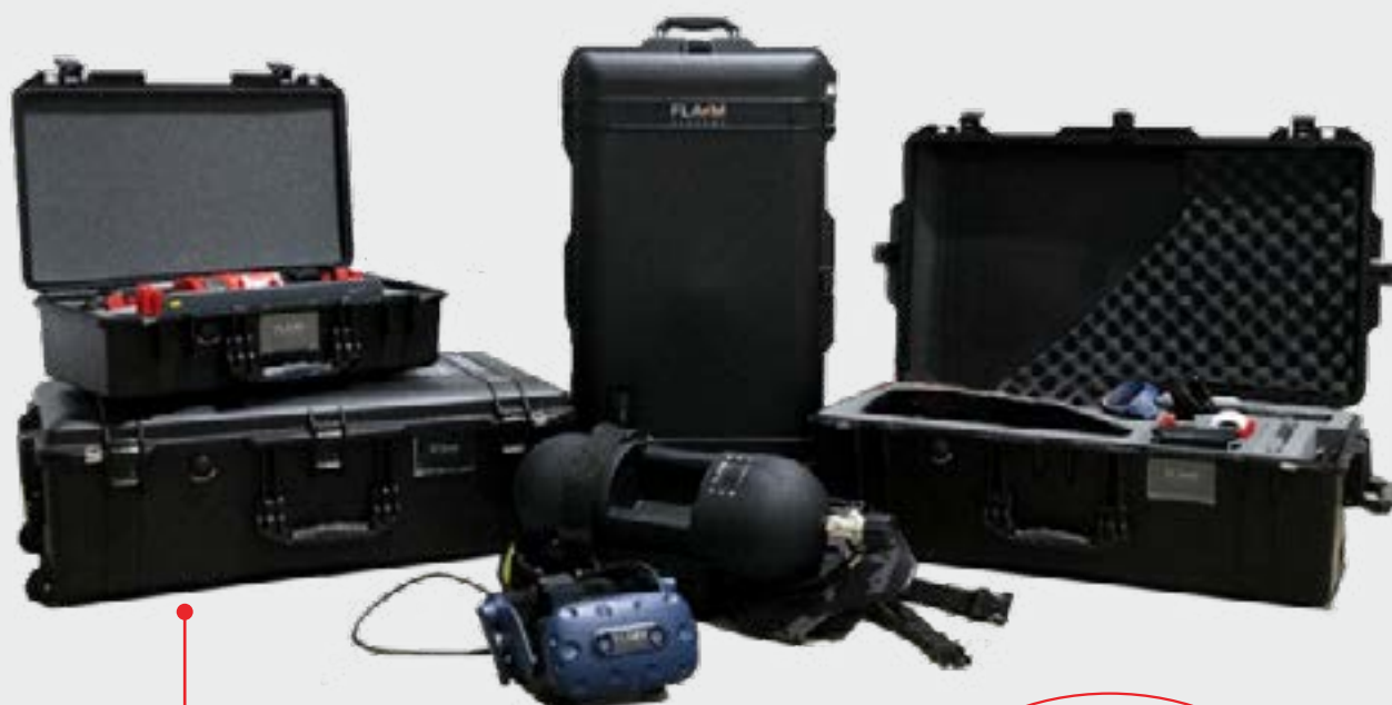
Figure 6: The FLAIM Trainer system

FS-FT2 excl. Hose Reel Assy and Heat Suit incl. 1yr Warranty, Licence and Software Subscription. FLAIM Trainer LITE can be upgraded by purchasing Hose Reel Assy. and Heat Suit at later date.