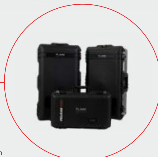
Figure 7: Standard packaging for the FLAIM Trainer system