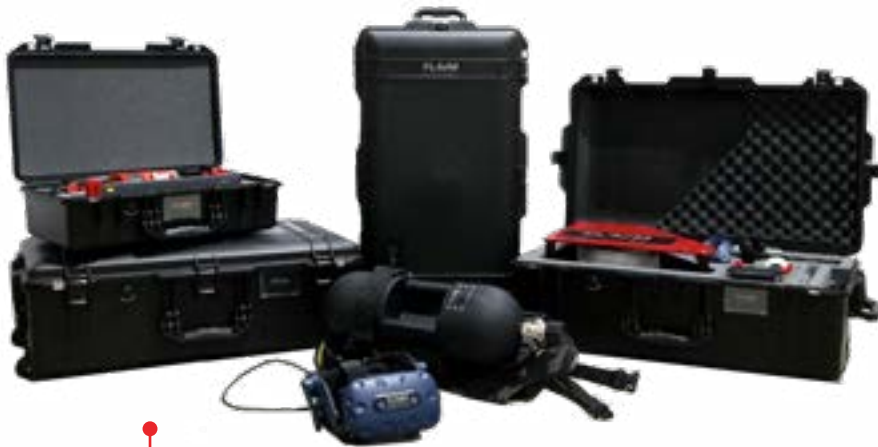
Figure 1: The FLAIM Trainer system